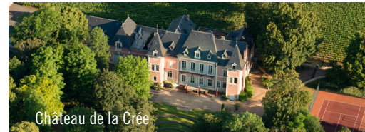
Château de la Créé

Tickets, Auction Details + more: ClassicWinesAuction.com