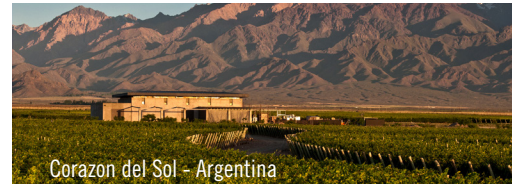
Corazon del Sol - Argentina