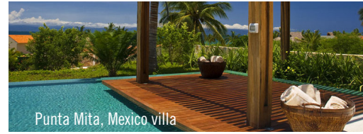
Punta Mita, Mexico villa