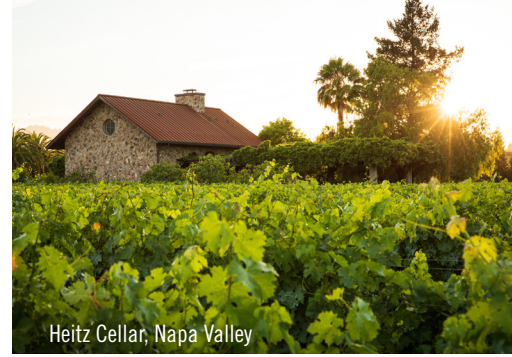
Heitz Cellar, Napa Valley