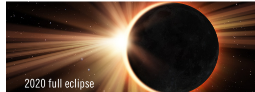
2020 full eclipse