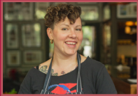
Althea Grey Potter Oui! Wine Bar + Restaurant